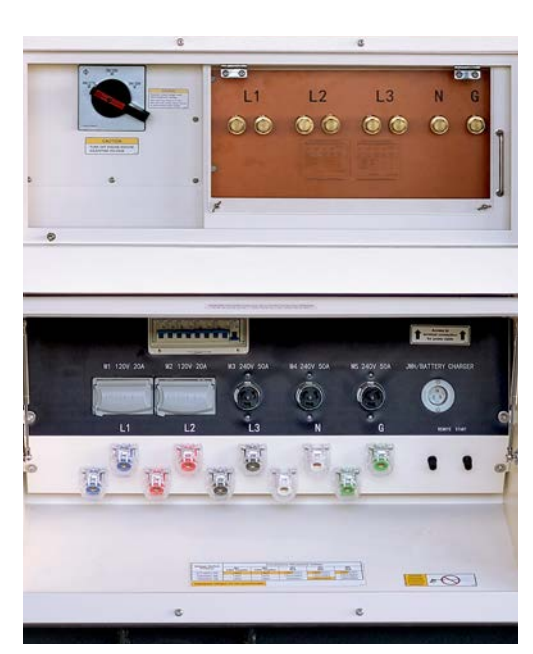
Lug and camlock connections