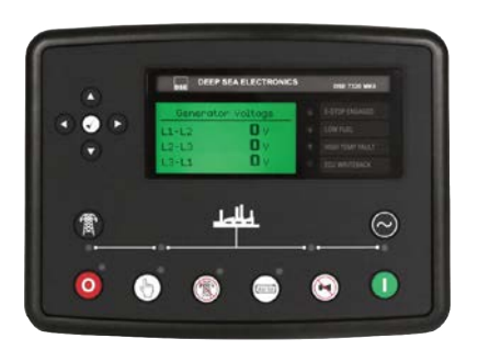
Deep Sea 7320-series digital controller

The WSP220-R is a great alternative to Tier 4F models, providing a complete rental ready package built for the construction, energy, telecom and industrial markets.