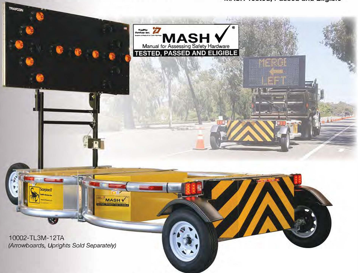
10002-TL3M-12TA (Arrowboards, Uprights Sold Separately)

Scorpion II ® TL-3 Towable Attenuator MASH Tested, Passed and Eligible