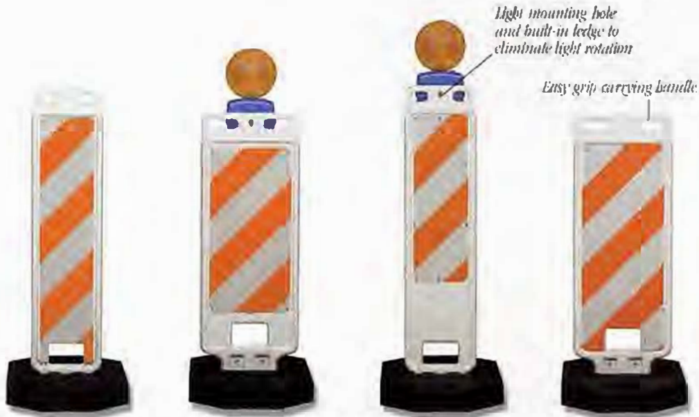
36" x 8" TrafFix Vertical Panel Barricade with 28lb. recycled rubber base 34000 Series

Tested and certified to meet the crashworthy requirements of NCHRP-350 and M.U.T.C.D. standards