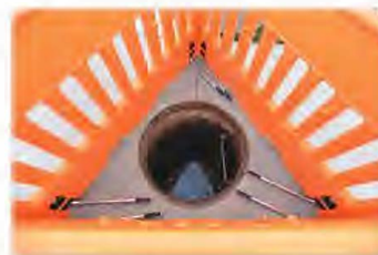
Protect Pedestrians From Work Zone Hazards