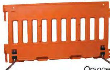
57000-AO Orange ADA Pedestrian Wall