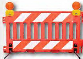
Locations for Two Barricade Lights and Recessed Areas for Reflective Sheeting