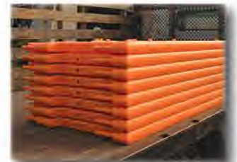
Four Molded-In Stacking Lugs for Secure Transport and Storage.