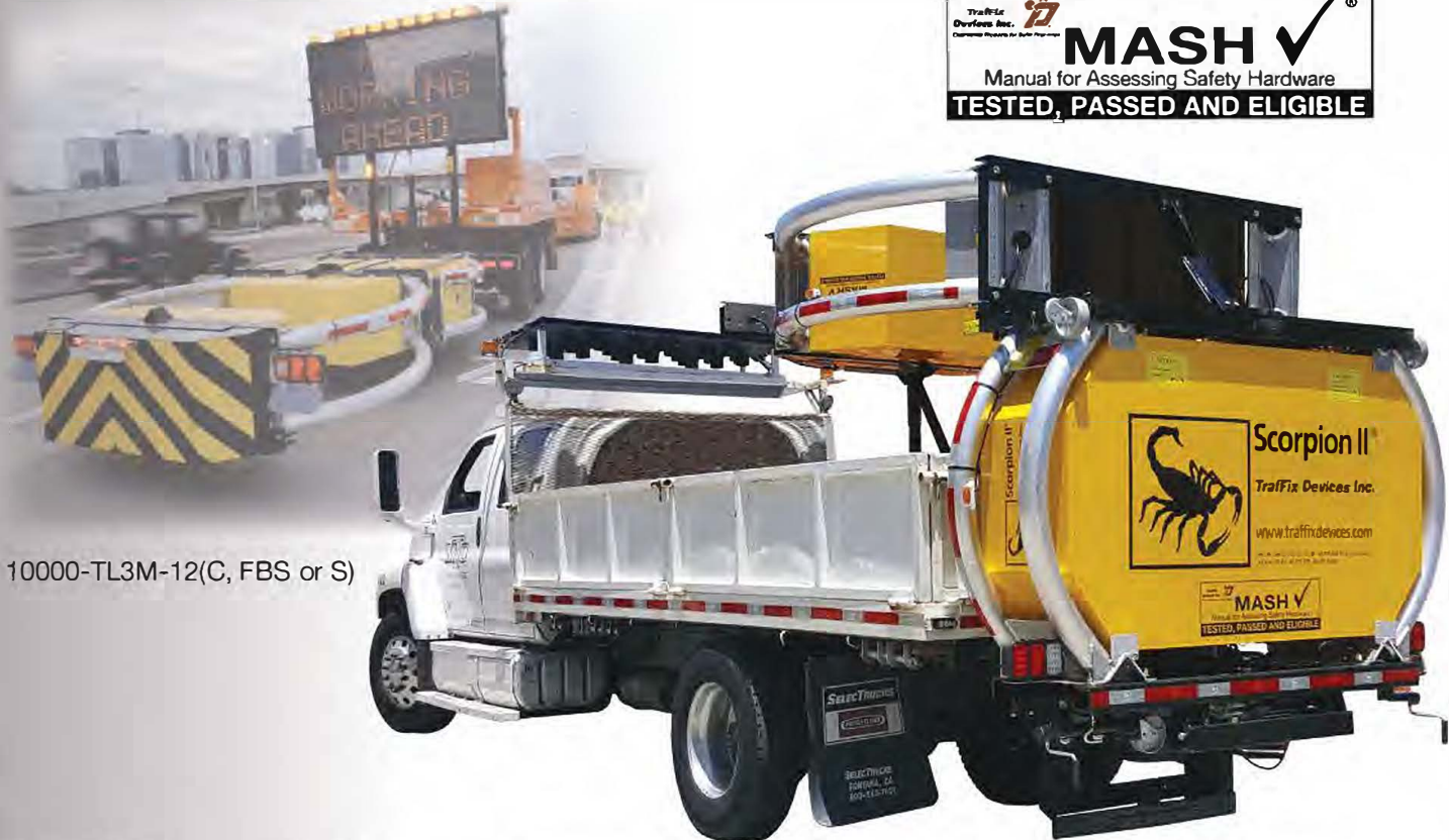
10000-TL3M-12(C, FBS or S)