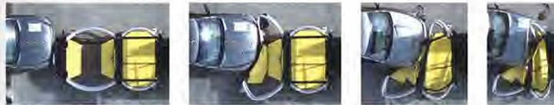
Scorpion II ® TL-3 TMA Impacted by 5,046 lbs (2,289 kg) Pick-Up Truck