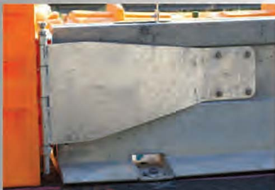
Steel Barrier Attachment