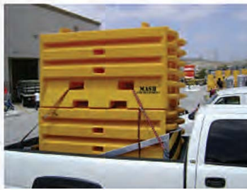
SLED™ TL-3 Transports in a Pick-Up Truck