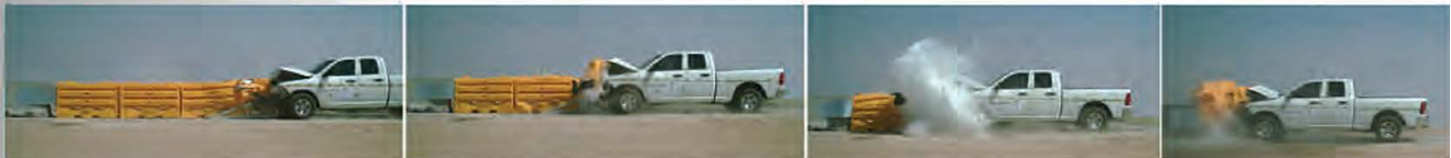
SLED™ TL-3 4900 lb. Pick-Up Truck Impact Attached to Concrete Median Barrier Wall

* Steel and plastic NCHRP 350 approved only.