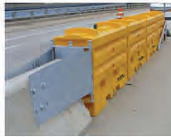
Concrete Barrier Attachment