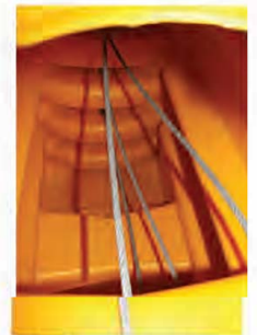
SLED™ Internal Cables