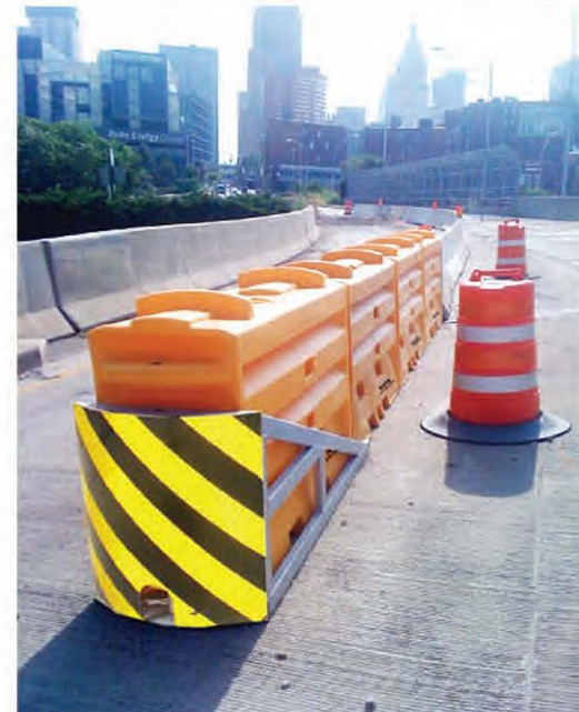
SLED™ TL-3 in Downtown Cincinnati, Ohio