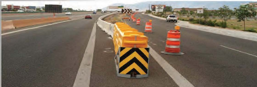
SLED™ TL-3 in New Mexico