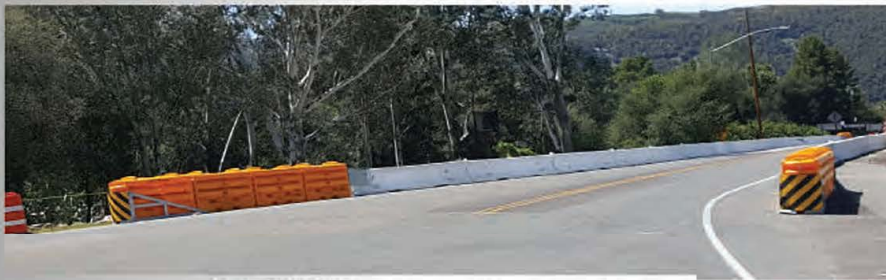
SLED™ TL-3 in use on a San Diego Roadway