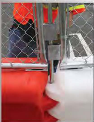
T-Pin Connects Wall to Wall and Fence to Fence