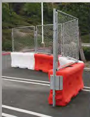
Water-Wall Fence Rotates up to 30° Degrees

The chain link fence will attach to the top of a longitudinal barrier, (TrafFix Water-Wall™), creating additional security to a work zone. The mesh fence will be made of 11 gauge steel, connected to vertical steel posts of 1 5/8" diameter. Fence sections will be 6' wide x 4' tall. Each fence section shall weigh no more than 42 lbs including the connector T-pin. Each T-pin will extend down through the sections of fence into the knuckles of the TrafFix Water-Wall to securely connect the fence to the wall. Each T-pin shall have a hole at the upper end for a security bolt to enhance security. The fence will accommodate a 6' single gate or a 12' double gate for entrance or exit from the work zone. For maximum stability, the TrafFix Water-Wall, filled with water will weigh 1,110 pounds. Overall height of the Water-Wall Fence attached to the top of the TrafFix Water-Wall will be a minimum 84".