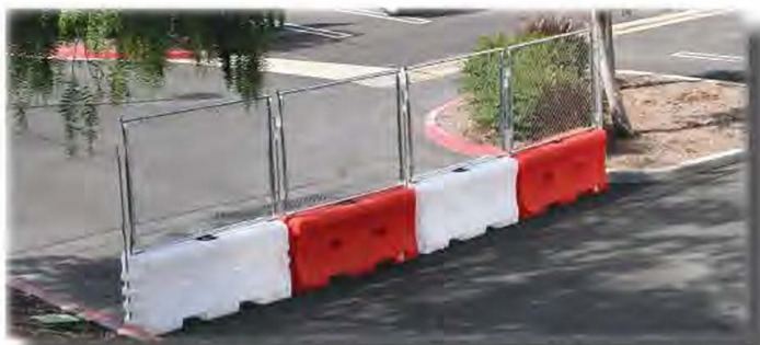
Ideal for vertical construction. Secure and easy to deploy.