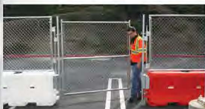
Secure entry with a 6' Single Gate