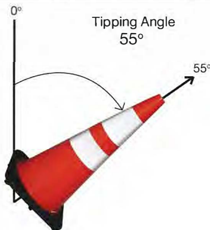
10 lb. PVC

60% of weight in base 40% of weight in stem