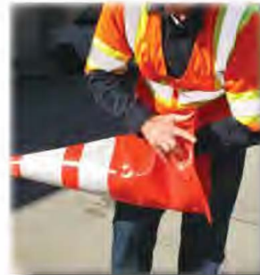
No ripped or torn PVC, simply reshape