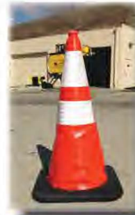
Drop base over stem and reuse